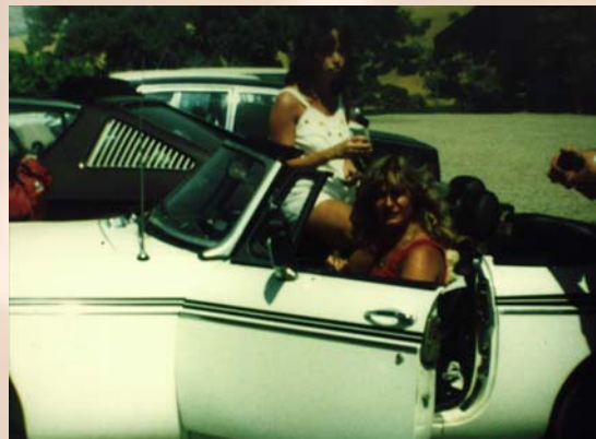
Touring the California wine country